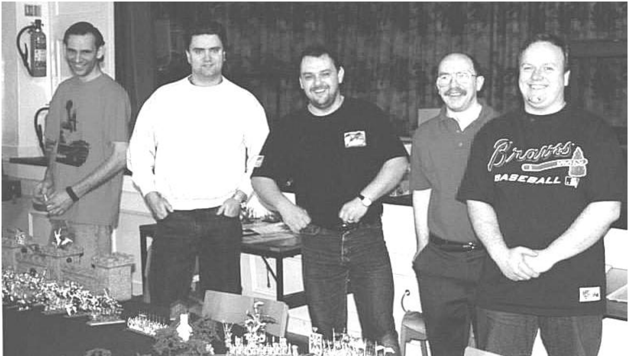
The "Good Guys"