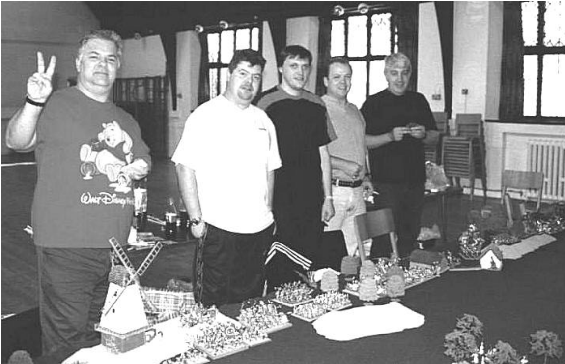
The "Bad Guys"

We played good guys against bad guys (what else!). The good guys were represented by Two Orc armies, Chaos Beastmen, Chaos Dwarves and Undead against the bad guys represented by Dwarves, High Elves, Bretonnians, Wood Elves and Empire (what makes you think that I was playing for the former rather than the latter?).