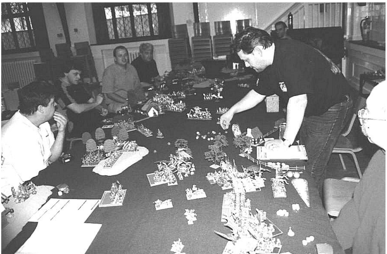
Battle Rages !